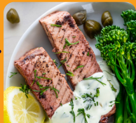
TOFU CENTER PIECE / FILLET