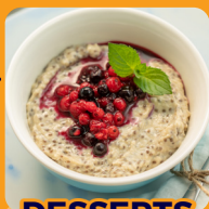
DESSERTS FROM TOFU