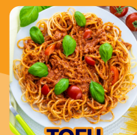
TOFU READY MEALS